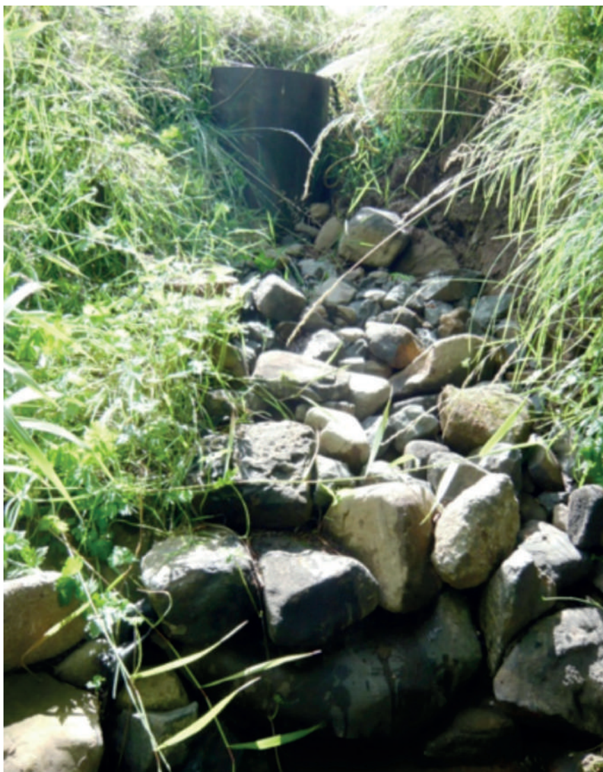
Figure 4: View from the watercourse of the completed abstraction point seen in Figure 3.