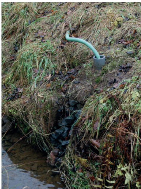
Figure 2: Abstraction point supplying a pasture pump. Pump inlet hose going into abstraction chamber fitted with a removable inlet screen. Abstraction sump chamber formed from pipe with diameter 150mm.