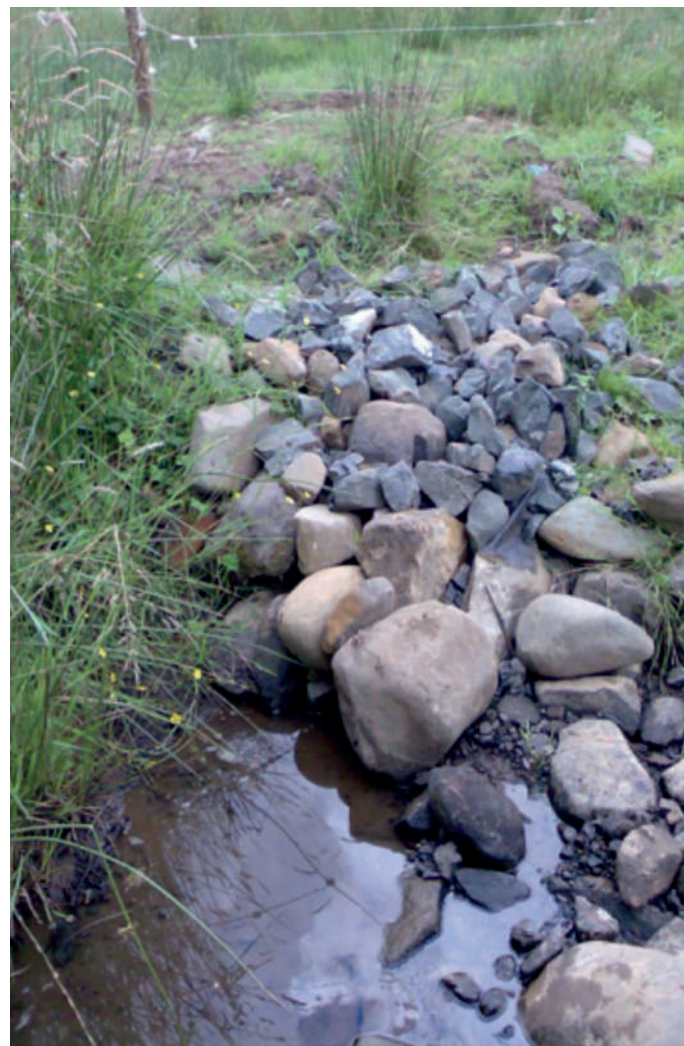
Figure 7: Completed abstraction point as seen in Figure 6, viewed from the watercourse.