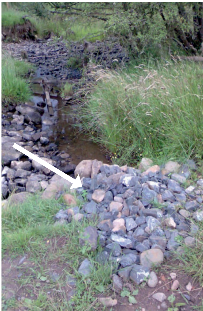
Figure 6: Completed abstraction point. Arrow indicates abstraction point inlet. Transfer pipe used at this site was 100mm diameter; this will vary from site to site.