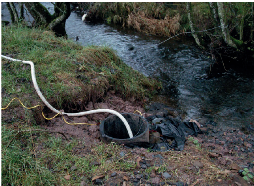
Figure 3: Abstraction point under construction to support a submersible pump with low level float switch. Abstraction sump chamber formed from pipe with diameter 450mm.